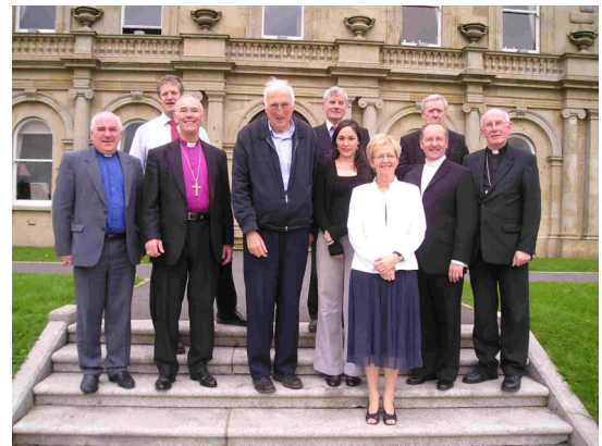
Church leaders with Jean Vanier at Dromantine September 24th

The church leaders were challenged to ‘move beyond their clan’ and to risk humiliation in the search for love in a broken society and world. Church leaders acknowledged the importance of this task and agreed that the search for unity was a question of vulnerability and service rather than structures and bureaucracy.